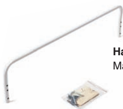
Handrail Made from Steel