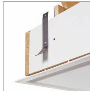
Installation Clips: Makes installation quick and easy.