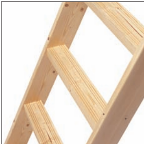
Safe Treads: Deep grooved treads assure a sure footing on every step.