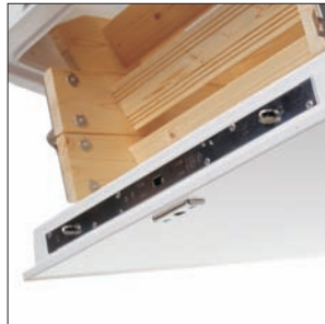
Beautiful Hatch: Insulated with built-in lock.