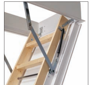
Gas Piston: Safe and easy to open and close.