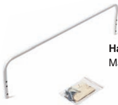
Handrail Made from Steel